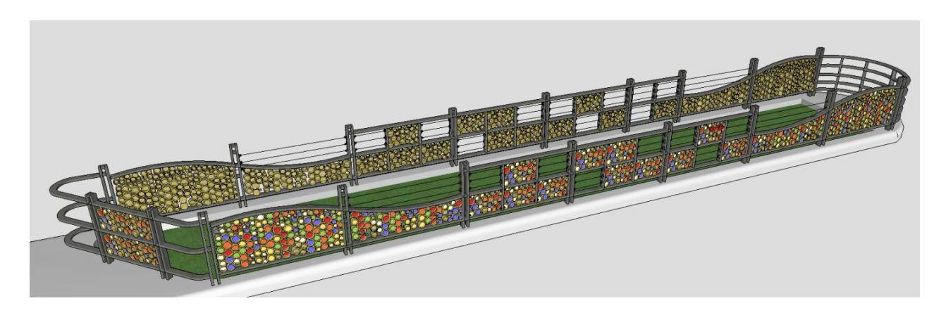
View of fencing along mediar