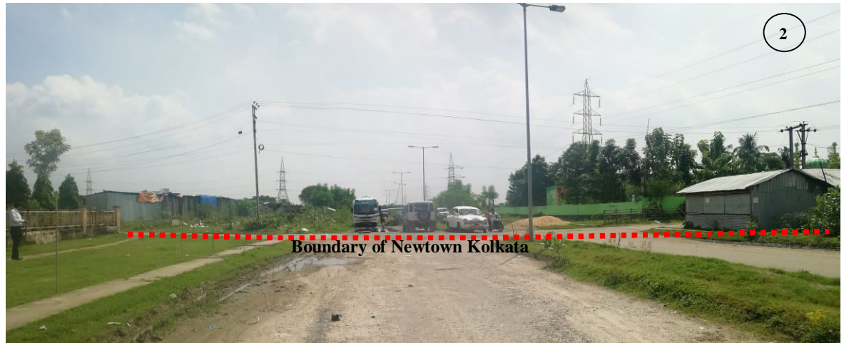
Figure 0-3 Proposed project site showing the existing carriage way

The project of temporary fencing and cattle grid has been conceived from Narcotic Control Bureau Building plot line to the peripheral canal. The length of the fence will be 38.2 meter among which 10.2 meters stretch is from NCB building plot line to the carriageway and the 28 meters stretch is from carriage way to canal edge. Both the lengths of the fencing will be on ROW to be developed in future hence the fencing will have to be temporary.