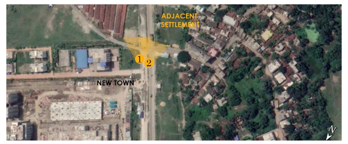
Figure 0-1: Key map for site pictures Source: NKDA

Figure: Proposed project site area Source: NKDA