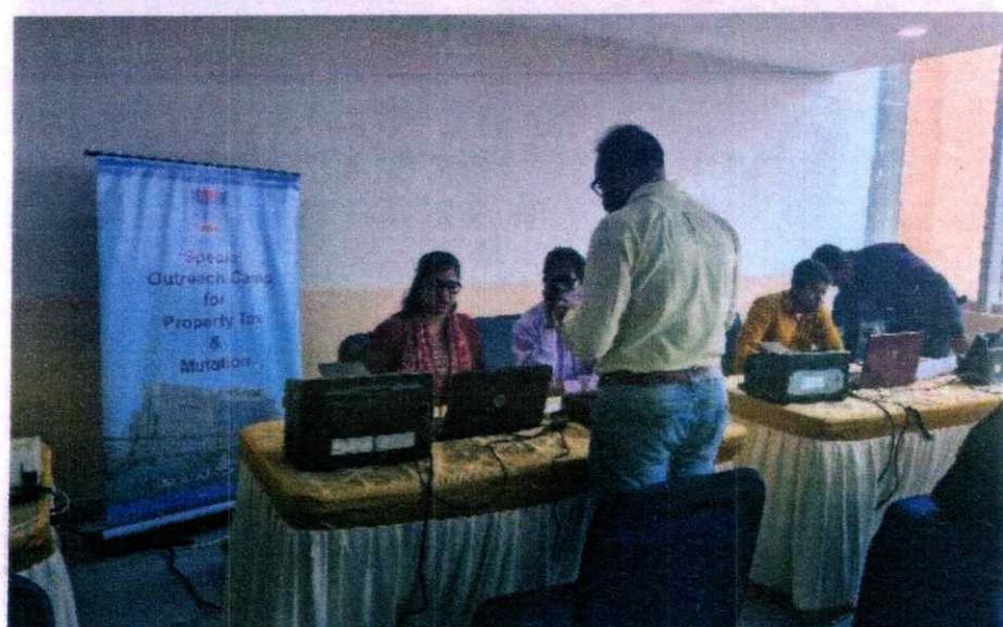
Few glimpses of the property tax camps held at the different residential units in the last two months

In a conclusion, the cumulative effect of these efforts by NKDA is expected to not only significantly augment the city's revenue base but also foster a culture of civic responsibility, thereby reinforcing the financial foundation necessary for New Town's progressive growth.